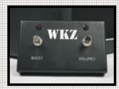
■ Gain boost and a second master level. So simple, it's brilliant