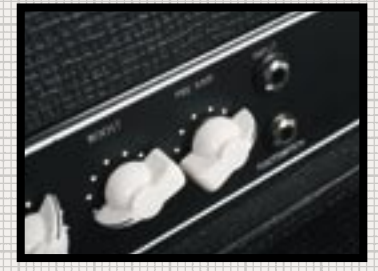
■ The included footswitch plugs into the front panel minimising hassle when setting up

A SUPERB DEBUT FROM A NEW NAME IN BRITISH HAND-BUILT AMPS